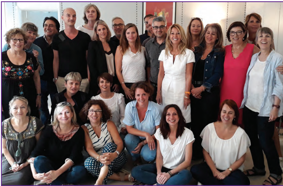
As usual, the Ecole d'AT-Paris or EAT (Paris school of TA–psychotherapy) resumed the school year in the fall of 2018 with their back-to-school event. Shown are the members of the Séminaire d'Exploration des Motivations (SEM), who, over 2½ days, explored their reasons for wanting to become TA therapists. This year, everyone passed, so these are the happy faces of the people who will be continuing in the training (along with a few of the EAT trainers).