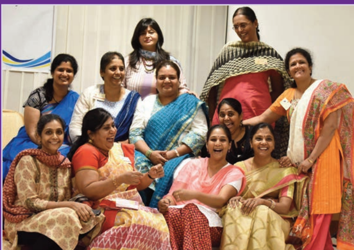
Volunteer members of the conference core organizing committee