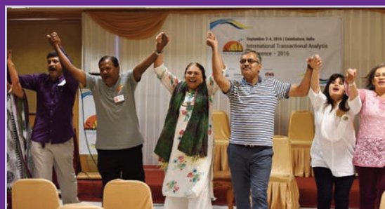
Closing session and saying good-bye