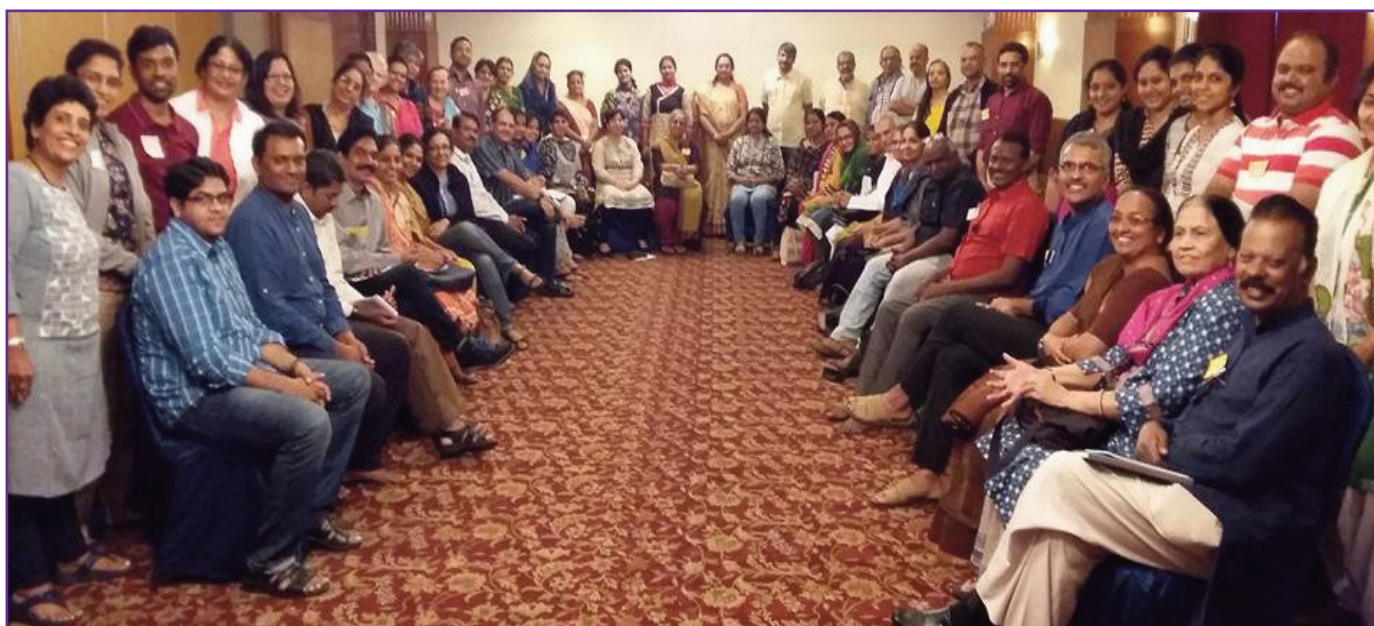
Participants at the 2016 Multilevel Learning program in Chennai

communication, contracting, permission, potency, and protection. Various perspectives about case studies from different fields of specialization were discussed. We had a good deal to learn from those who are further along in their TA training than we are. We also understood how even at the PTSTA or TSTA level, it is OK to have blind spots. What we need to do is reflect on and learn from our mistakes.