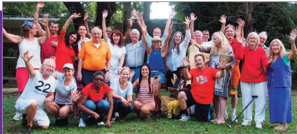
Enthusiastic participants at the 2016 USATAA Gathering in Jamaica